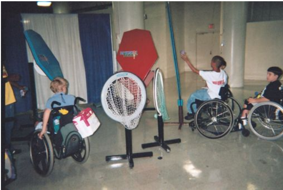
WHEELCHAIR ATHLETES – INTEGRATION PARTICIPATION IN 2002 TOURNAMENT