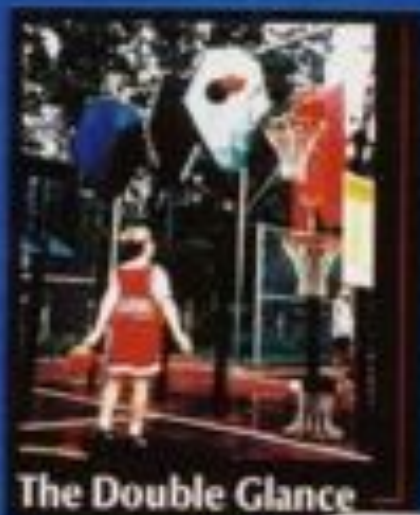
The Double Glance