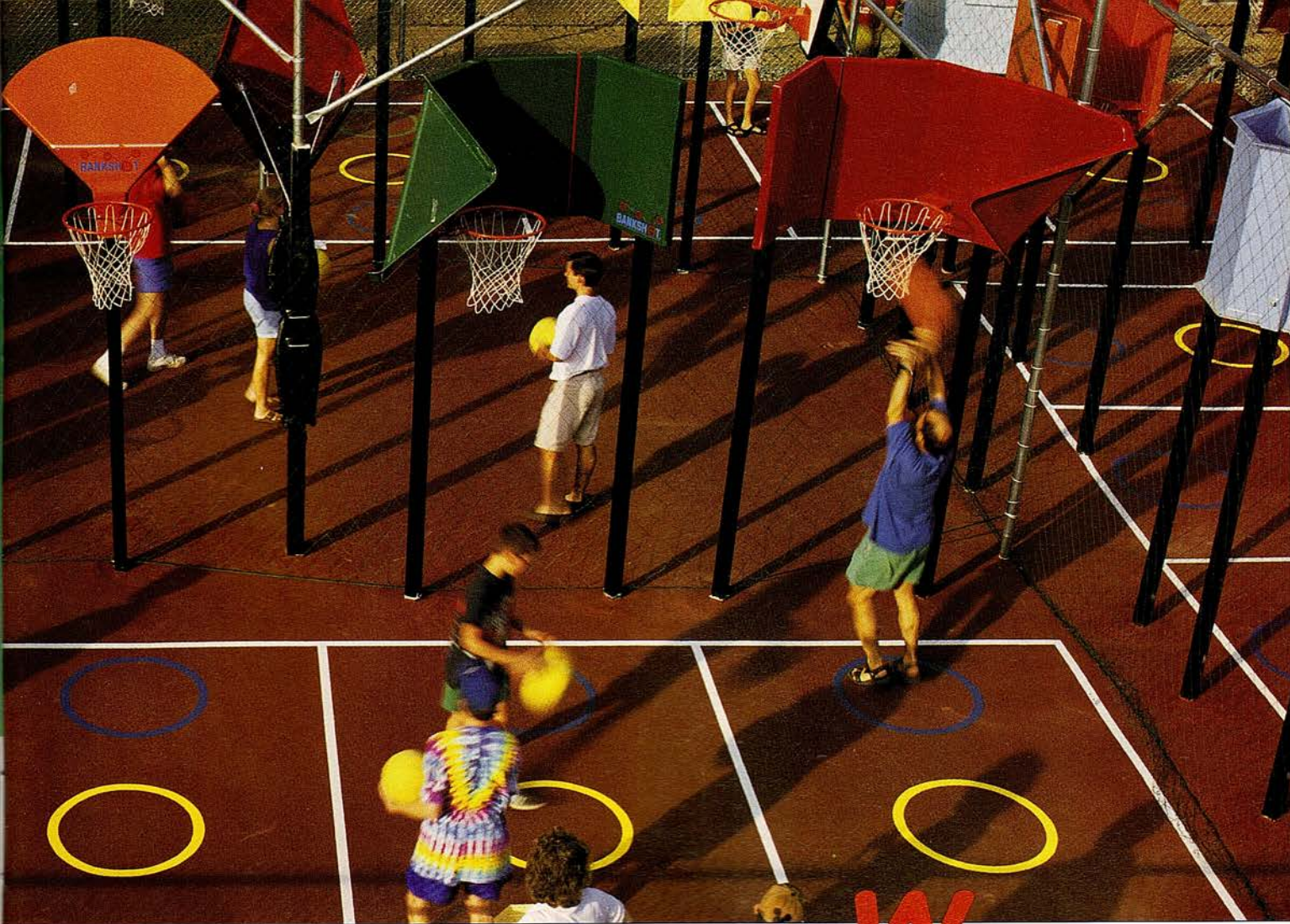
▶ A SOFT TOUCH by Louie puts the ball on a path to score in the “wrap-around right” basket.