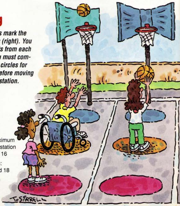
ART BY TERRY SIRRELL